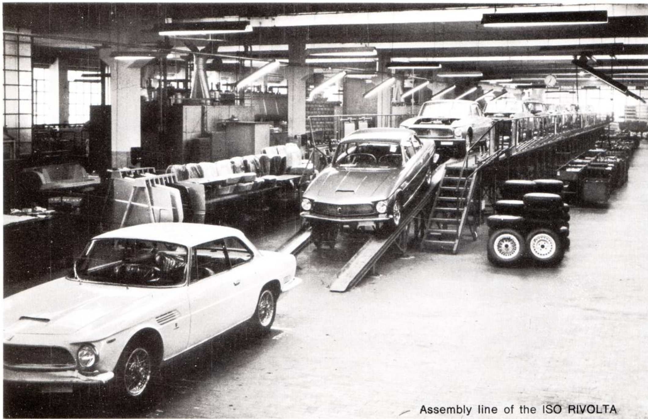
Assembly line of the ISO RIVOLTA